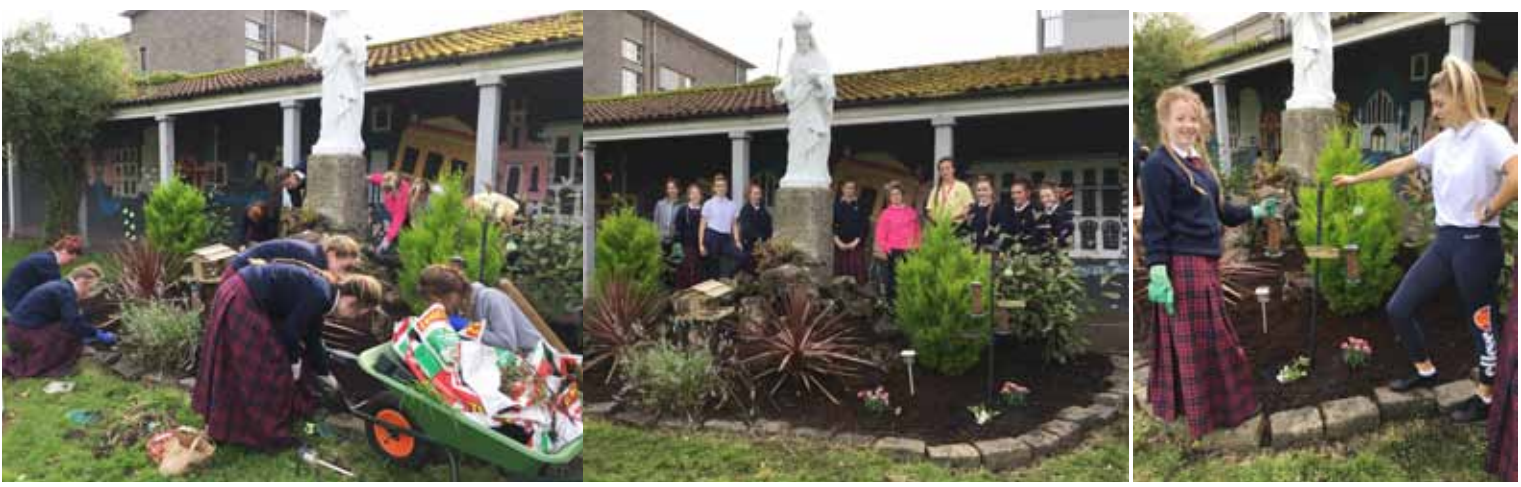
6LCA students cleaning, weeding and planting beside our Christ the King statue

Educational progression for our recent leaving certificate students has been excellent, with 84% of all graduates, both traditional and LCA, progressing onto some form of further education and training. 38% of the traditional leaving cert group have been offered 3rd level courses, predominately in LIT and UL. The main areas of study being social studies, humanities, business, economics and science. Huge congratulations to each student on their fantastic results and every best wish for the future