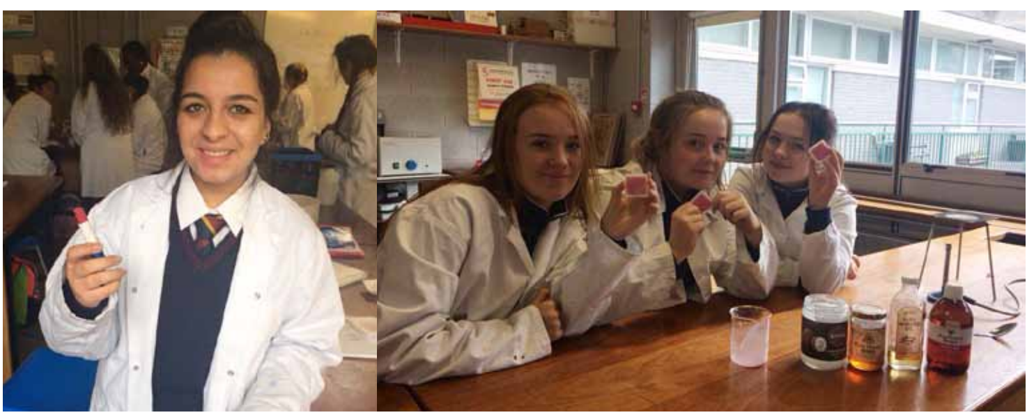
Transition year students making lip gloss and lip stick! Because they're worth it.