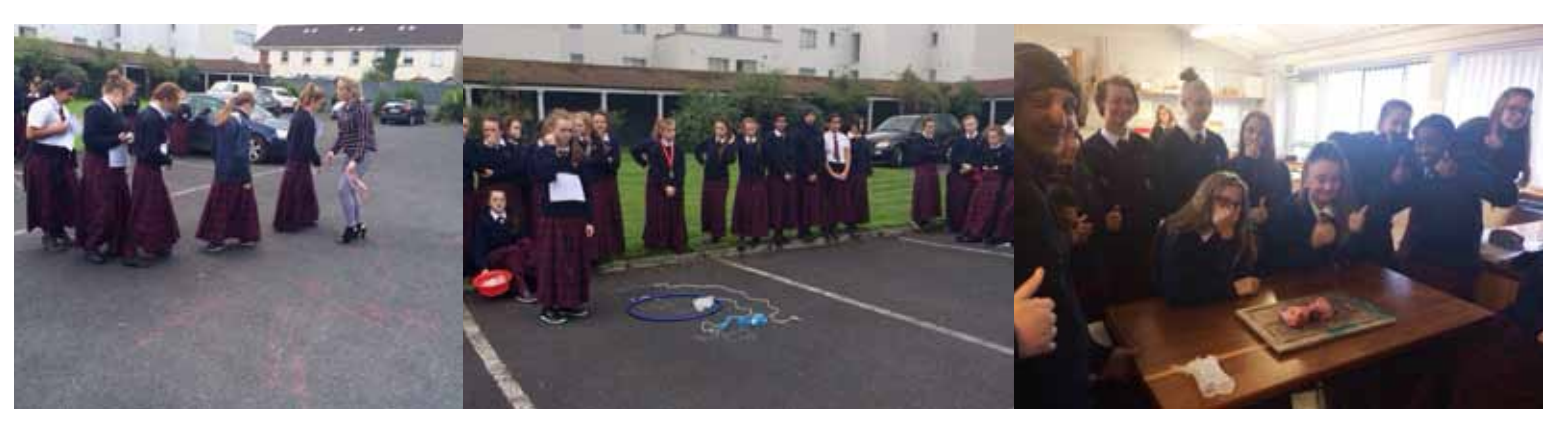
Second years acting out blood flow through the heart.